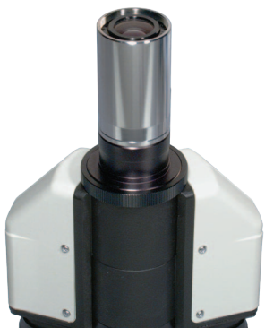
Bino Vue set up with Extension Coupler and 2x Amplifier for parfocalization. Do Not Use Filters.

It is still safe to insert the Bino Vue into 2" Tele Vue diagonals with the 2"-1 1/4" Tele Vue "High-Hat" adapter without hitting the diagonal mirror. If a filter is threaded onto the Bino Vue in this configuration, it WILL hit the mirror. Take precautions to ensure this does not happen.