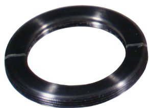
Bino Vue Flat Coupler

4) Thread the 2x Amplifier into the Extension Coupler