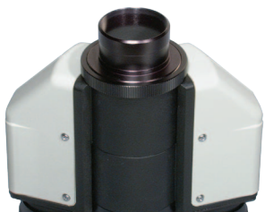
Bino Vue with Flat Coupler and Extension Coupler installed