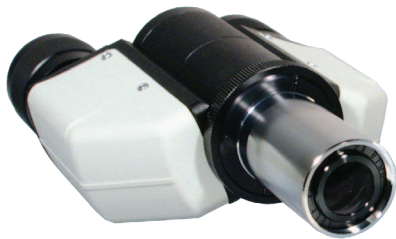
Bino Vue with Flat Coupler and 2x Amplifier. Filters may be used.

Bino Vue Package BVP-2002 - Bino Vue with Flat Coupler and 2x Amplifier installed - Extension Coupler* (* packaged separately)