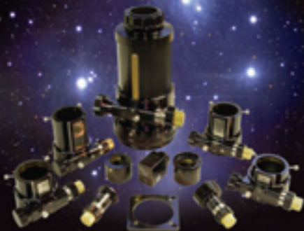
Focusers and Accessories