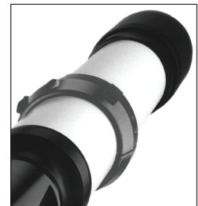
Ring Mount on Tele Vue telescope